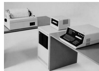
IBM 5110 "Personal Computer" circa 1978